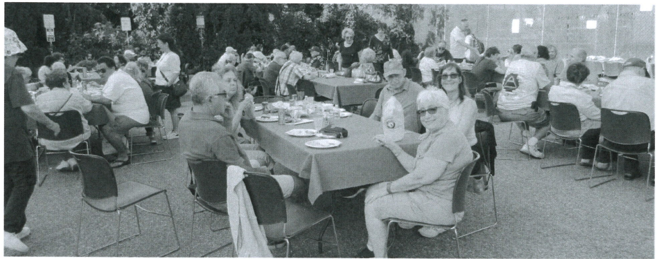
And a good time was had by all!